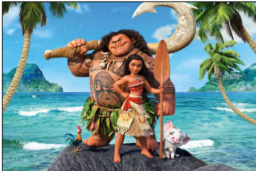
Our featured film: Moana

Friday, August 4 at 7:30 p.m. (Rain date: August 11)